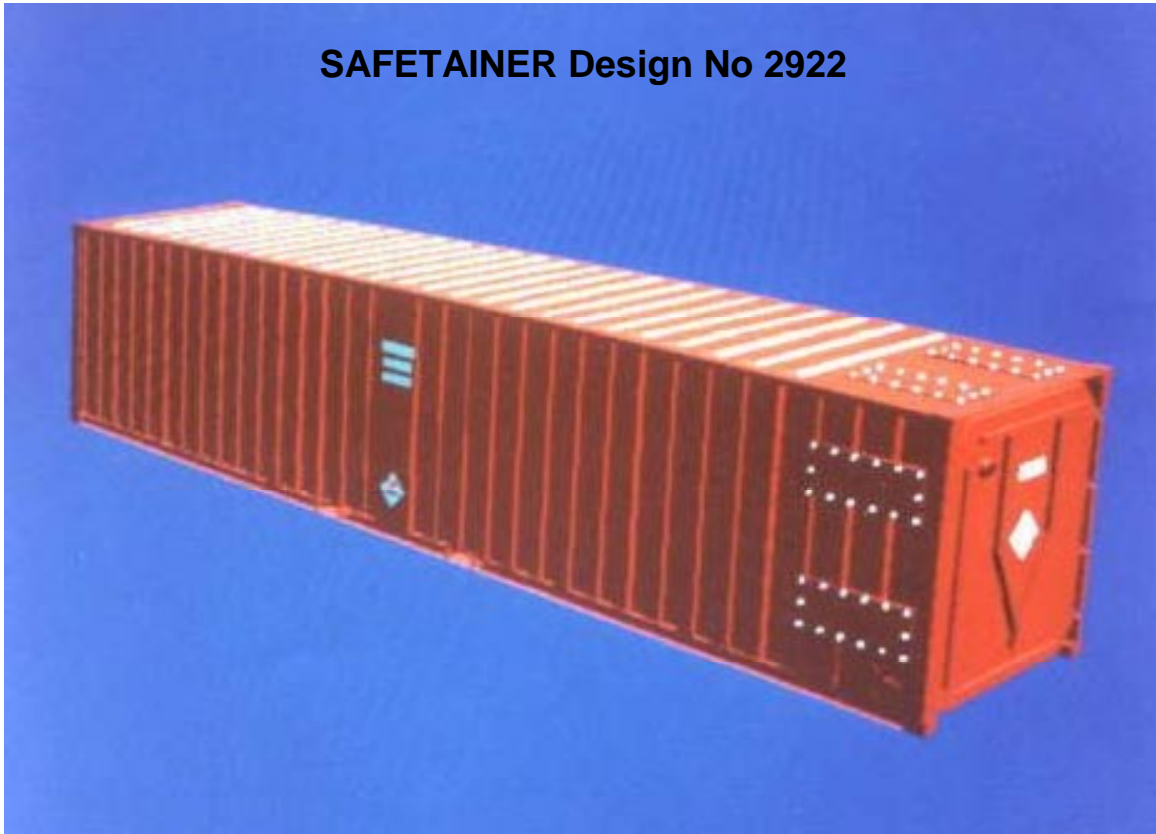
Illustration of Package Design N° 2922