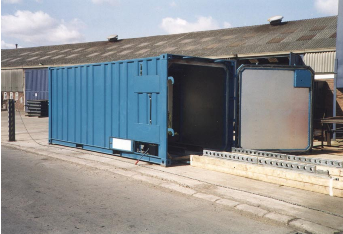
Illustration of SAFETAINER 2896